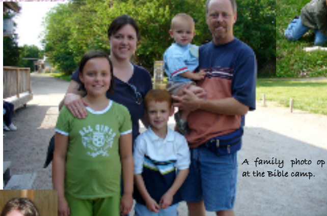
A family photo op at the Bible camp.